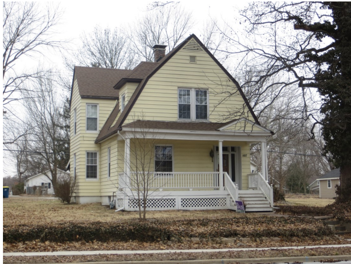
1107 Troy Road today (above) and as pictured in the Edwardsville Intelligencer in 1912. (Reinhardt)