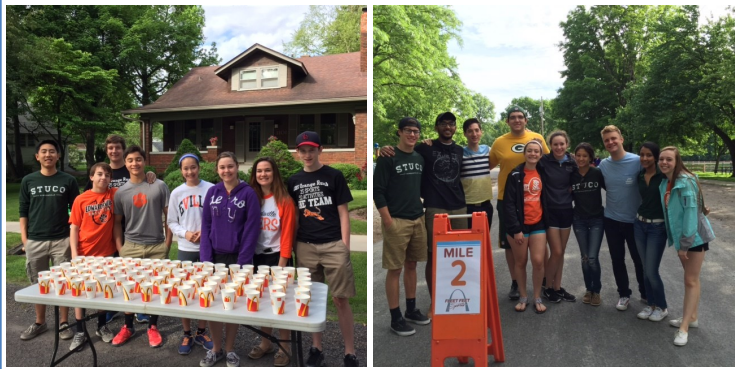
Some of the volunteers at the 2015 Run for Bonifest Water Station.

Join Friends of Leclaire on May 28 as they give a hearty Leclaire welcome, encouragement, and, of course, water, to runners as they pass Leclaire Park!