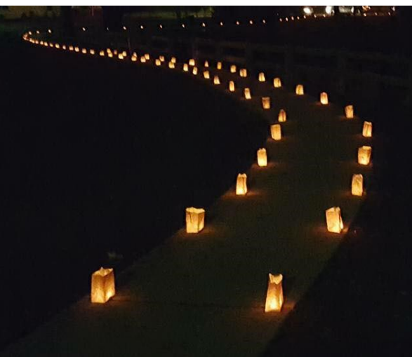
Luminaria in Leclaire.