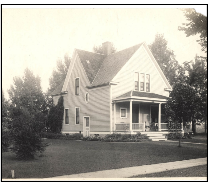
1024 Troy Road circa 1915.

After the Abbee family sold the house at 1024 Troy Road, there was a series of short term owners until 1979 when the stately home was purchased by the current owners.