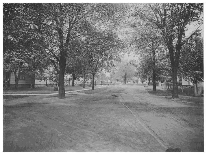
Early Leclaire streetscape; looking north from the corner of Hale and Jefferson.

Mature trees are one of the best features of an older neighborhood. But many of Leclaire's original trees, planted in the late 19th century, are now gone. Edwardsville's Beautification and Tree Commission (EBTC) encourages residents to plant trees to build a new canopy of trees in Edwardsville.