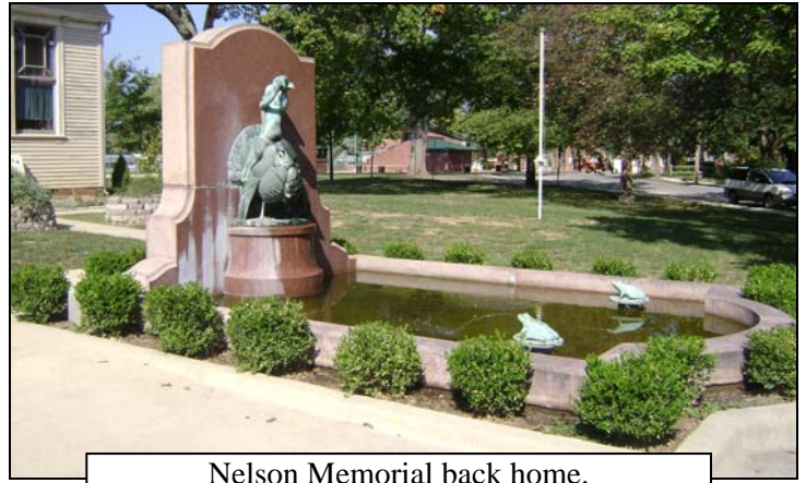
Nelson Memorial back home.