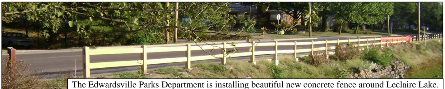
The Edwardsville Parks Department is installing beautiful new concrete fence around LeClaire Lake.