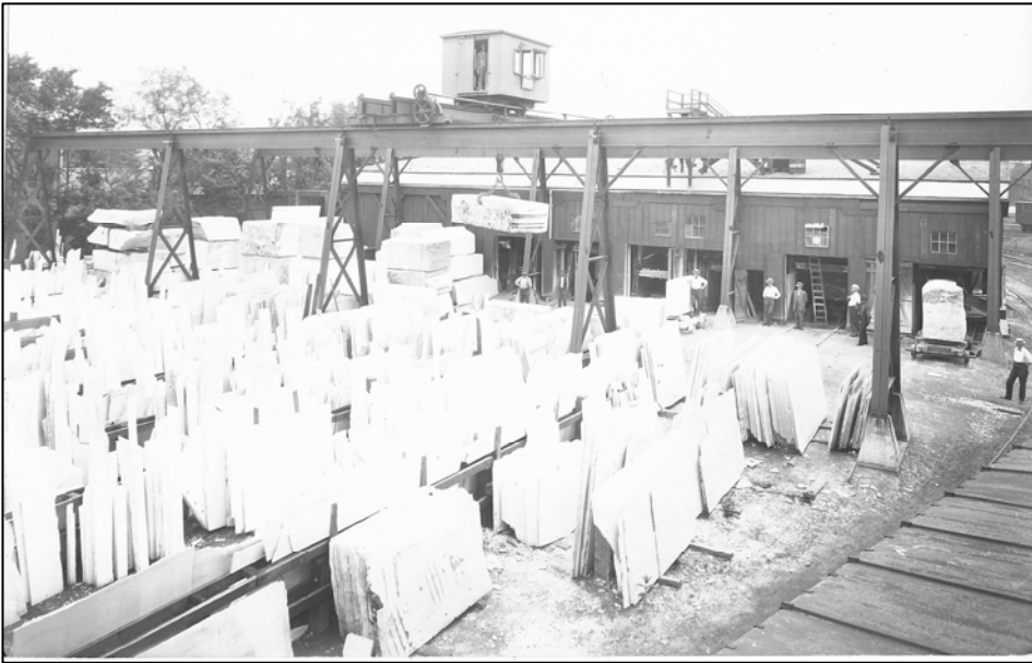
Marble Yard