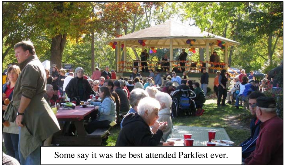
Some say it was the best attended Parkfest ever.