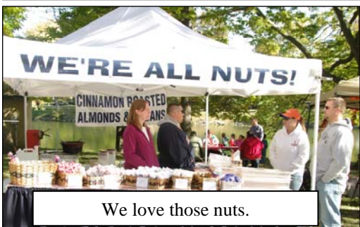
We love those nuts.