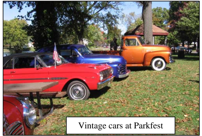
Vintage cars at Parkfest