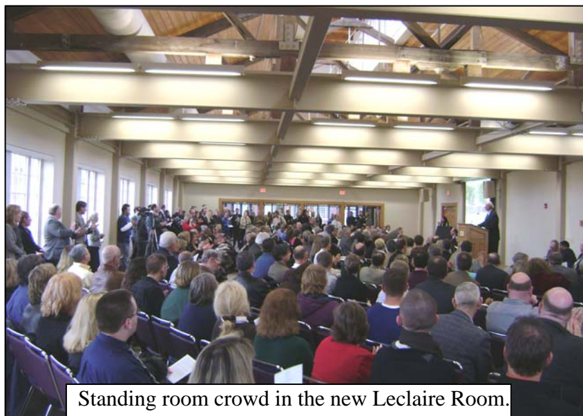
Standing room crowd in the new Leclaire Room.