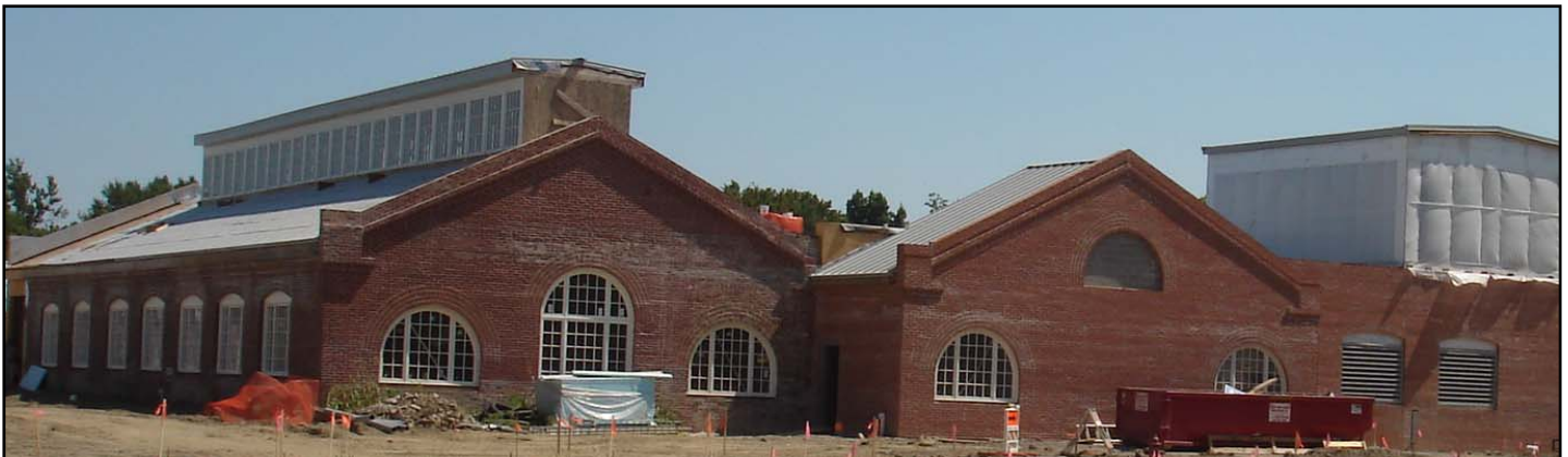
Coping and Marble Shop becoming part of South Section of Jay Hoffman Center at Nelson Campus of LCCC.

The Leclaire Room will be available for public events and meetings. Although it won't be completed until December, the room is already being scheduled for events. A dedication ceremony for the Hoffman Center is planned for December 5 th at 2 PM. The public is invited to attend.