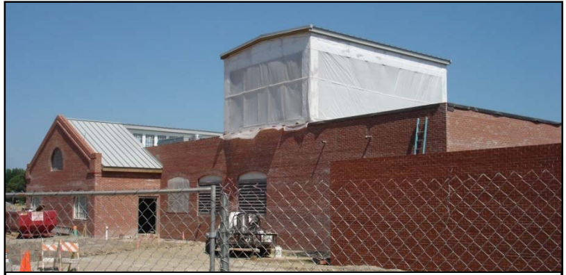
Progress on South Section of Jay Hoffman Center at Nelson